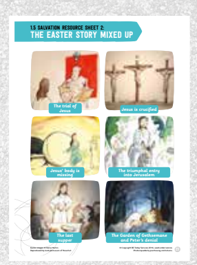
THE EASTER STORY MIXED UP