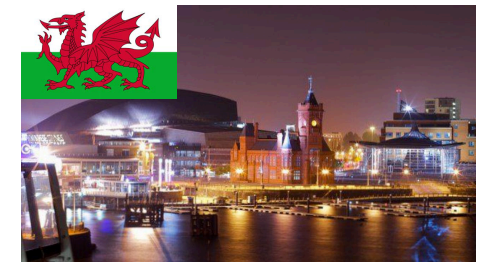
The population of Wales is around 3.1 million. The capital city of Wales is Cardiff. The population of Cardiff is more than 335,150.