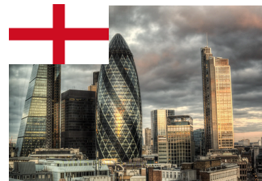
The population of England is around 56 million. The capital city of England is London. The population of London is more than 8 million.