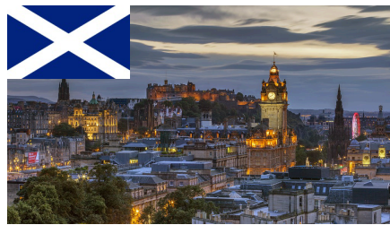
The population of Scotland is around 5 million. The capital city of Scotland is Edinburgh. The population of Edinburgh is more than 482,000.