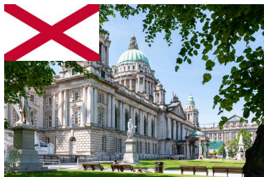
The population of Northern Ireland is around 1.8 million. The capital city of Northern Ireland is Belfast. The population of Belfast is more than 280,210.

The population in the UK is not distributed evenly across the four parts.