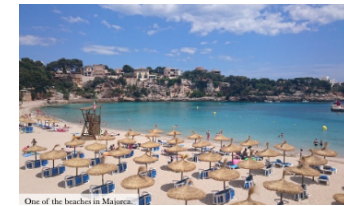
One of the beaches in Majorca.