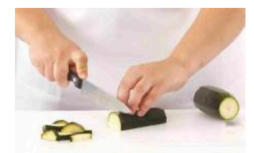
Cutting (claw technique)