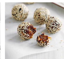
Dried fruit balls