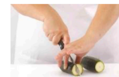
Cutting (bridge technique)